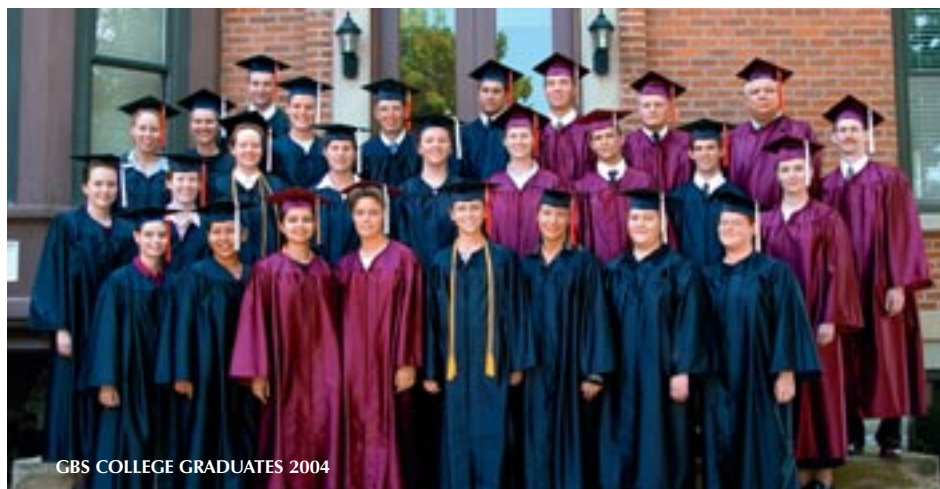
GBS COLLEGE GRADUATES 2004

Twenty-eight students received either associate or bachelor degrees, and seven-