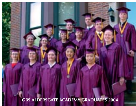
GBS ALDERSGATE ACADEMY GRADUATES 2004