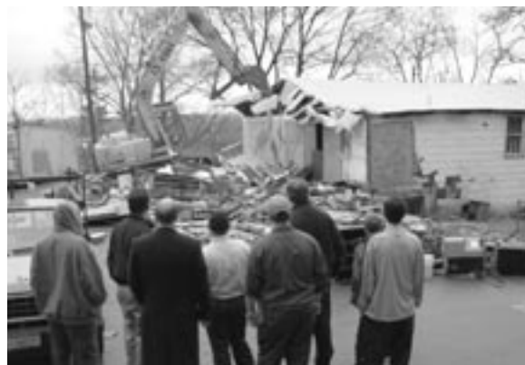
What goes up must come down! The photos here show both ends of the equation for the old dining hall. On the left is a picture of the groundbreaking ceremony, July 3, 1947; on the right are two views of the demolition, December 10, 2003.