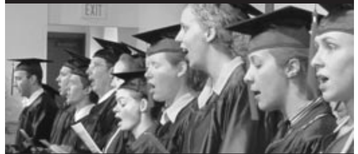
Examples of Single-Life Gift Annuity Rates