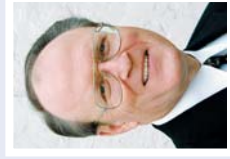
—sermon by DR. ALLAN P. BROWN

In our next sermon, we will learn the results we can expect when we fully yield ourselves to God.